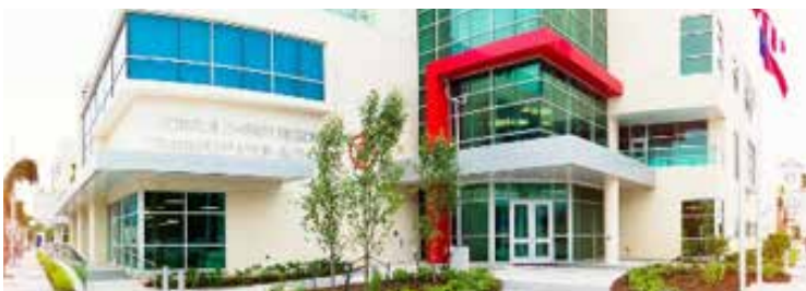
$34 Million CCRTA Customer Service Center