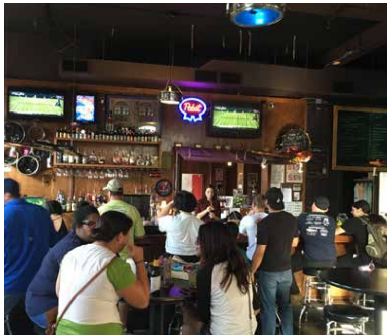
Local Favorite House of Rock in the Heart of the Marina Arts District