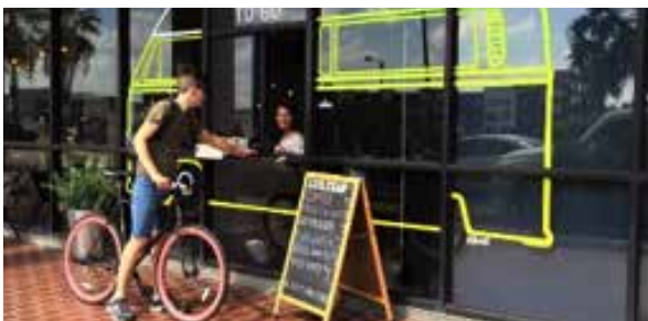
Green Light Coffee Provides Great Coffee For People on the Go!