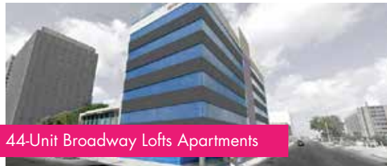
44-Unit Broadway Lofts Apartments