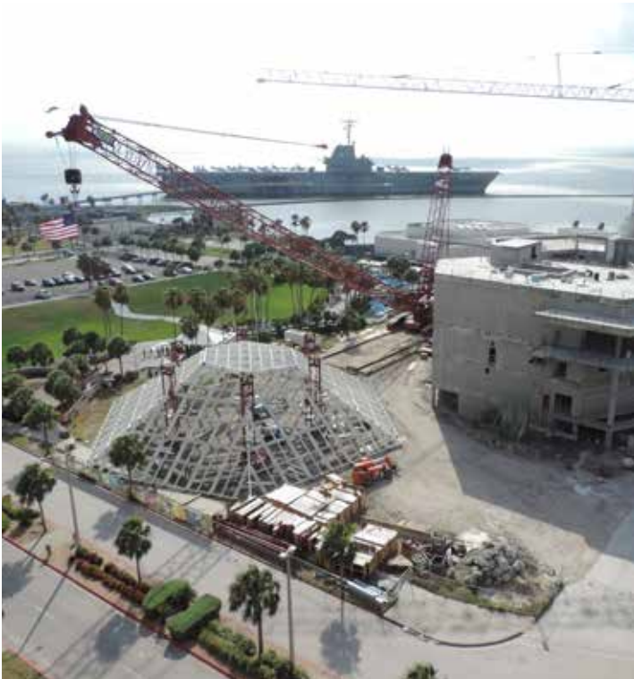
$50 Million Texas State Aquarium Caribbean Journey