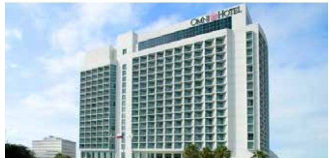
475-Room Omni Hotel Anchors the Bayfront Hotel Scene