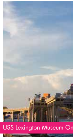
USS Lexington Museum On the Water