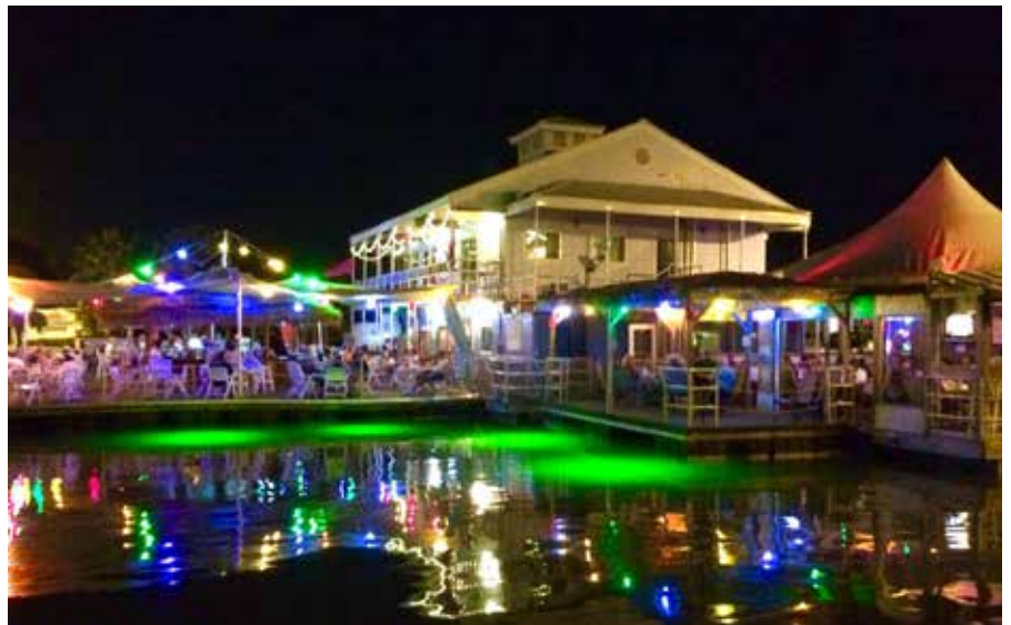
Harrisons Landing, Marina Hot Spot