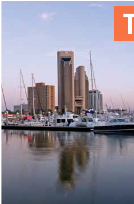
Corpus Christi Marina Anchors the Downtown Bayfront.