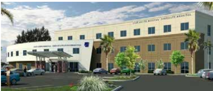
Post Acute Rehabilitation Hospital