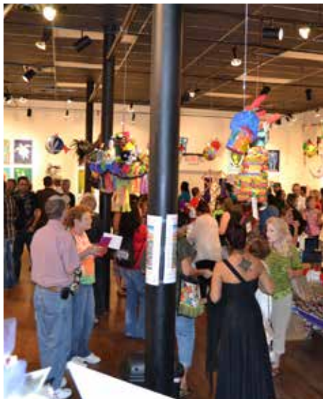
Vibrant Downtown Arts Scene Features the Art Museum of South Texas, More Than 50 Public Art Works and Murals, 25 Galleries and Studios, 20 Cultural and Art Events, and Historic Walking Tours.