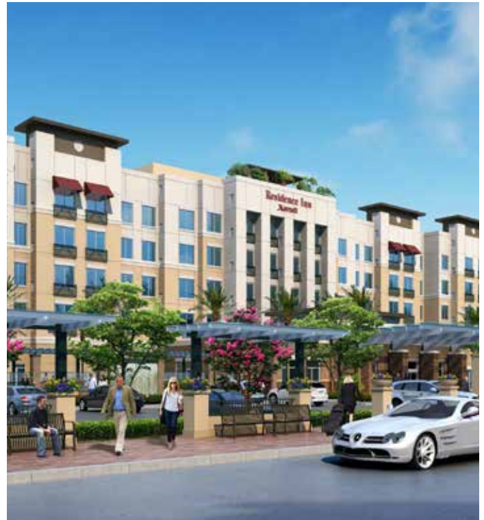
$15.3 Million Residence Inn