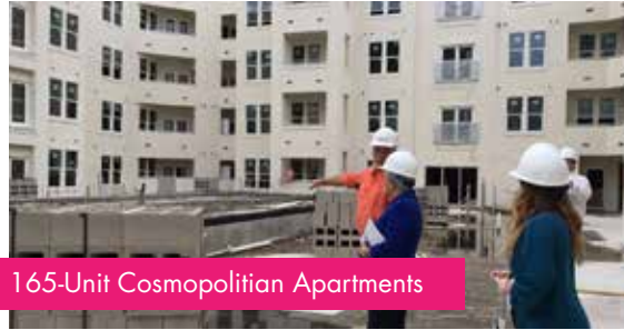
165-Unit Cosmopolitan Apartments