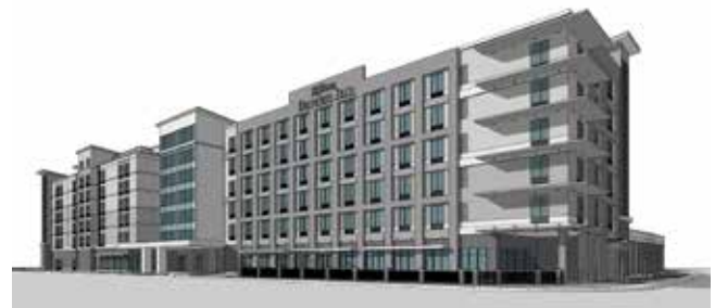
Planned Hilton Garden Inn & Homewood Suites in the SEA District