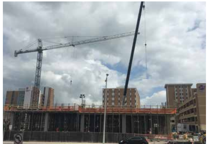
$325 Million Spohn Hospital