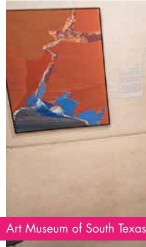
Art Museum of South Texas