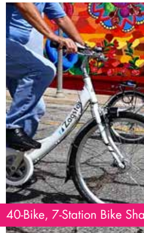
40-Bike, 7-Station Bike Share