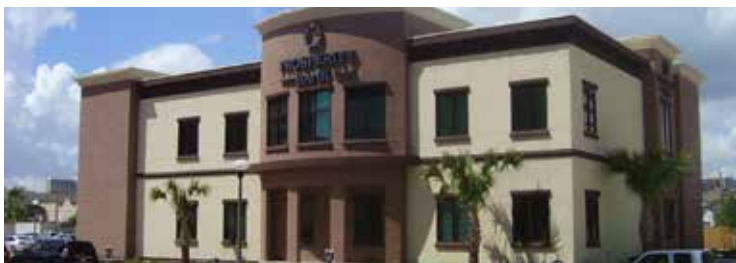
$2 Million Prosperity Bank Branch