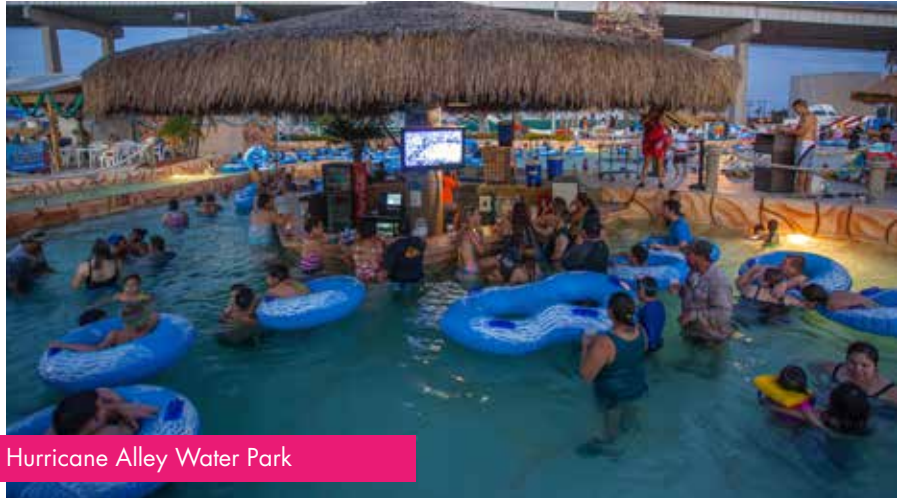
Hurricane Alley Water Park